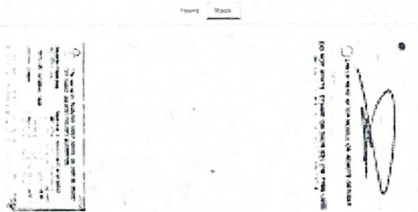
Storage Check .png 149K